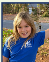
The Bird Girls